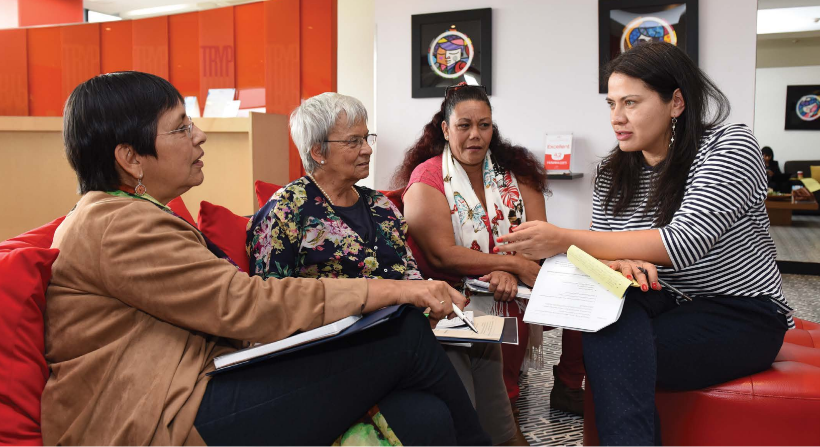
Members of the Colombian Network of Women Mediators (pictured in 2016) have substantial experience as peacebuilders in a country with decades of violent conflict. Members engage with the broader peacebuilding community in Latin America and beyond, acting as mentors and trainers.