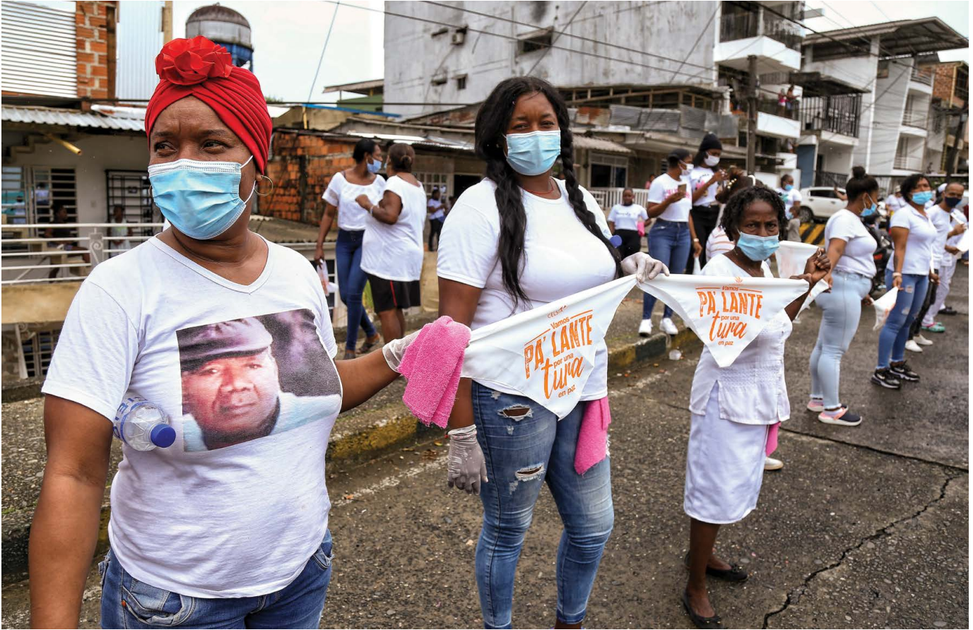
Women hold hands forming a human chain during a demonstration against increasing violence between illegal armed groups in Buenaventura, Colombia, on February 10, 2021.

organizations, informal structures were valuable because they could bring together people who might be operating in isolation in highly contentious spaces. Conscious that they were outside actors, the support organizations did not want to insist that facilitators be part of a formal and rigid structure.