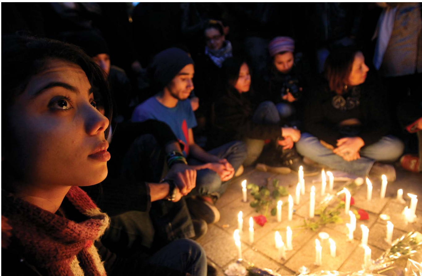
Young people gather around candles in Tunis on January 22, 2011, during three days of mourning for those who died in protests that led to the ousting of President Zine El Abidine Ben Ali.