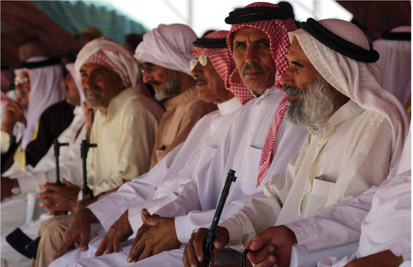
Sunni tribal leaders attend the graduation ceremony of Sunni tribal volunteers in Habaniyah, west of Baghdad, on June 17, 2015.

in which a peacebuilding intervention takes place. In most contexts, that implies the need to create facilitator teams made up of individuals whose backgrounds mirror the various groups involved in a conflict.